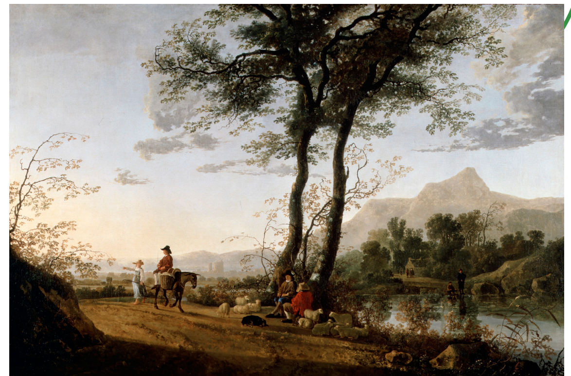
A Road Near a River, Aelbert Cuyp (c.1660)

WHEN DO YOU LAST REMEMBER BEING SURROUNDED BY NATURE?