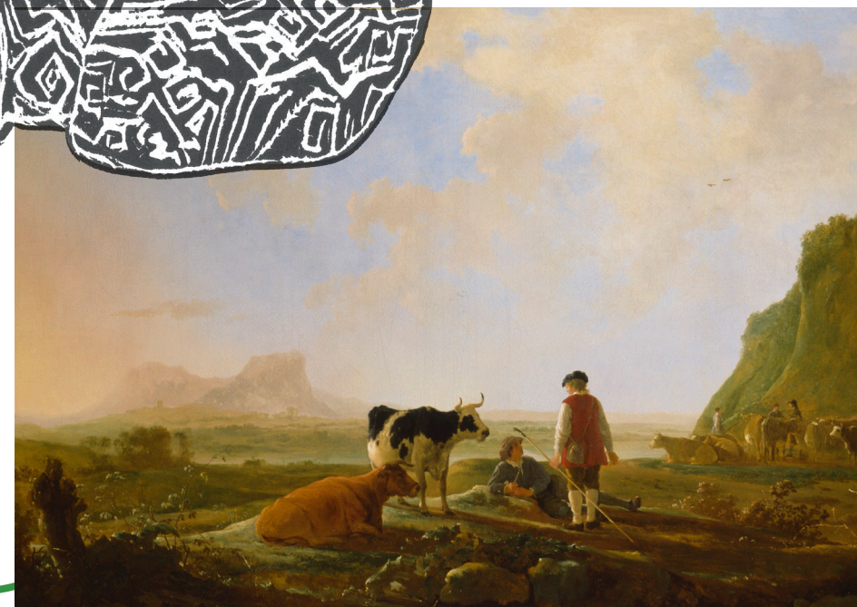
Herdsman with Cows, Aelbert Cuyp (Mid-1640s)

HOW DOES IT MAKE YOU FEEL TO BE IN NATURE?