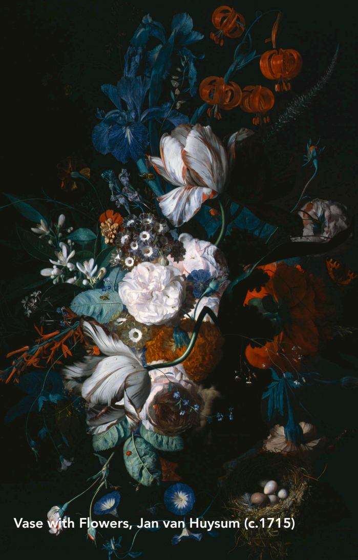
Vase with Flowers, Jan van Huysum (c.1715)