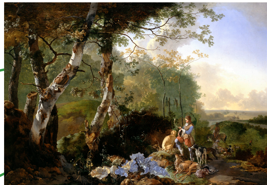
Landscape with Sportsman and Game, Adam Pynacker (c.1661-65)

Art and nature are interlinked; its shapes and colours, processes and energy provide creative inspiration. It is also a great source of solace and headspace for artists enabling them to find time to think and create. We have thought a lot about our relationship to nature and how we connect with the world around us.