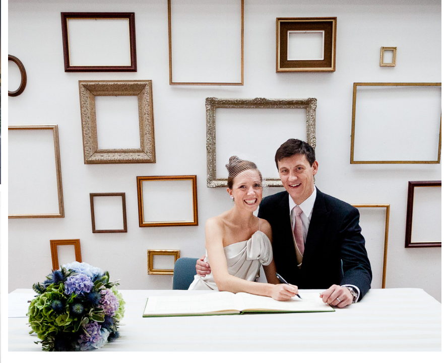
Linbury Room Capacities

Ceremony or dancing after dinner – up to 120 guests Seated wedding breakfast – up to 50 guests